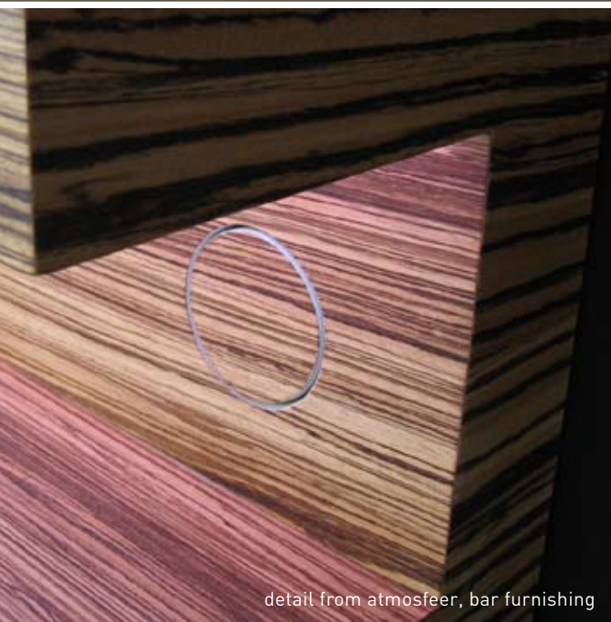
detail from atmosfeer, bar furnishing

Multimedia plugs and orientation lights are also part of the Mysterious range. Just like the switch, they discreetly meld in to the wall complementing your interior design.